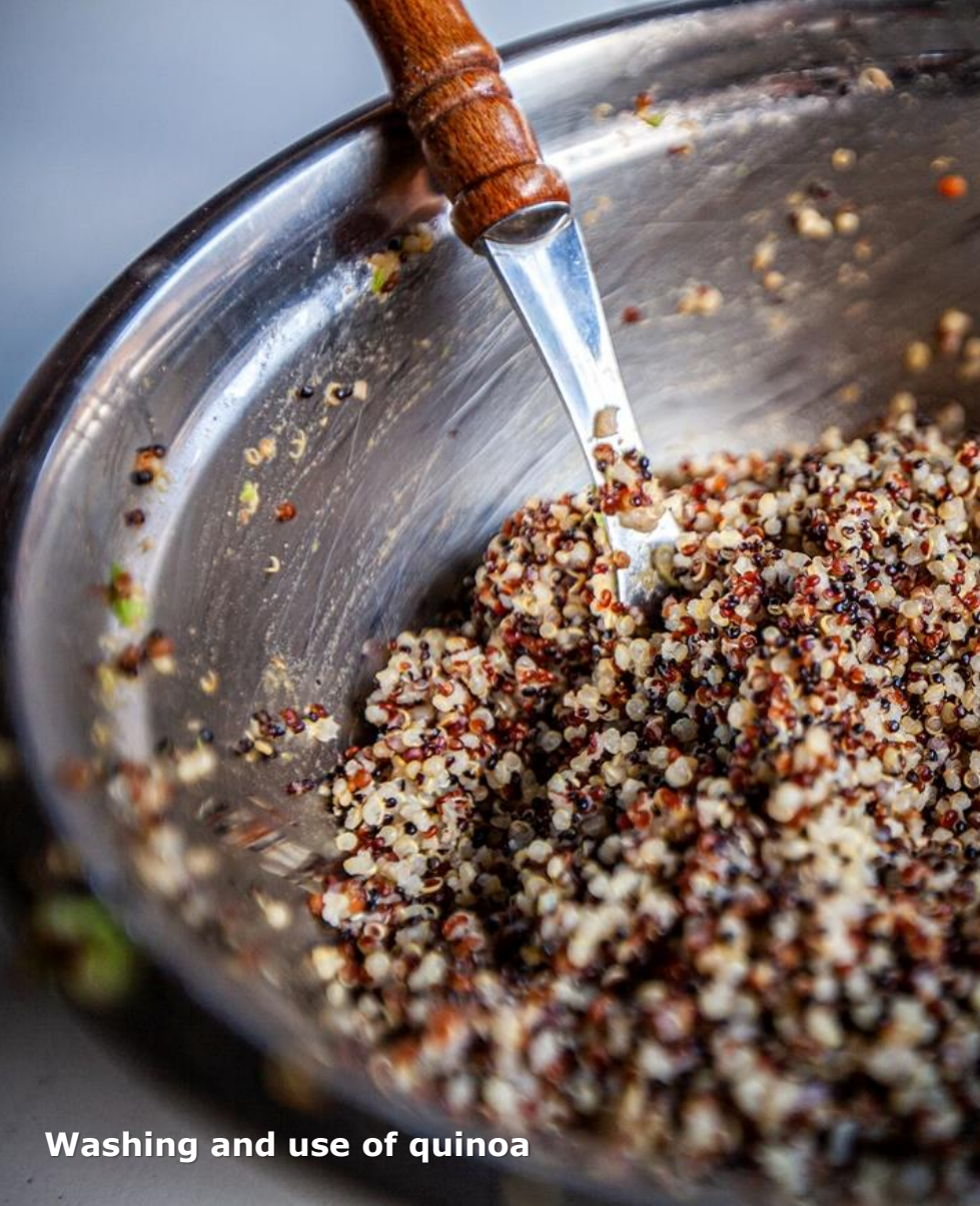
Washing and use of quinoa

the preparation of chuño and moraya, the washing and use of quinoa, elaboration of chicha de jora, and other Andean activities.