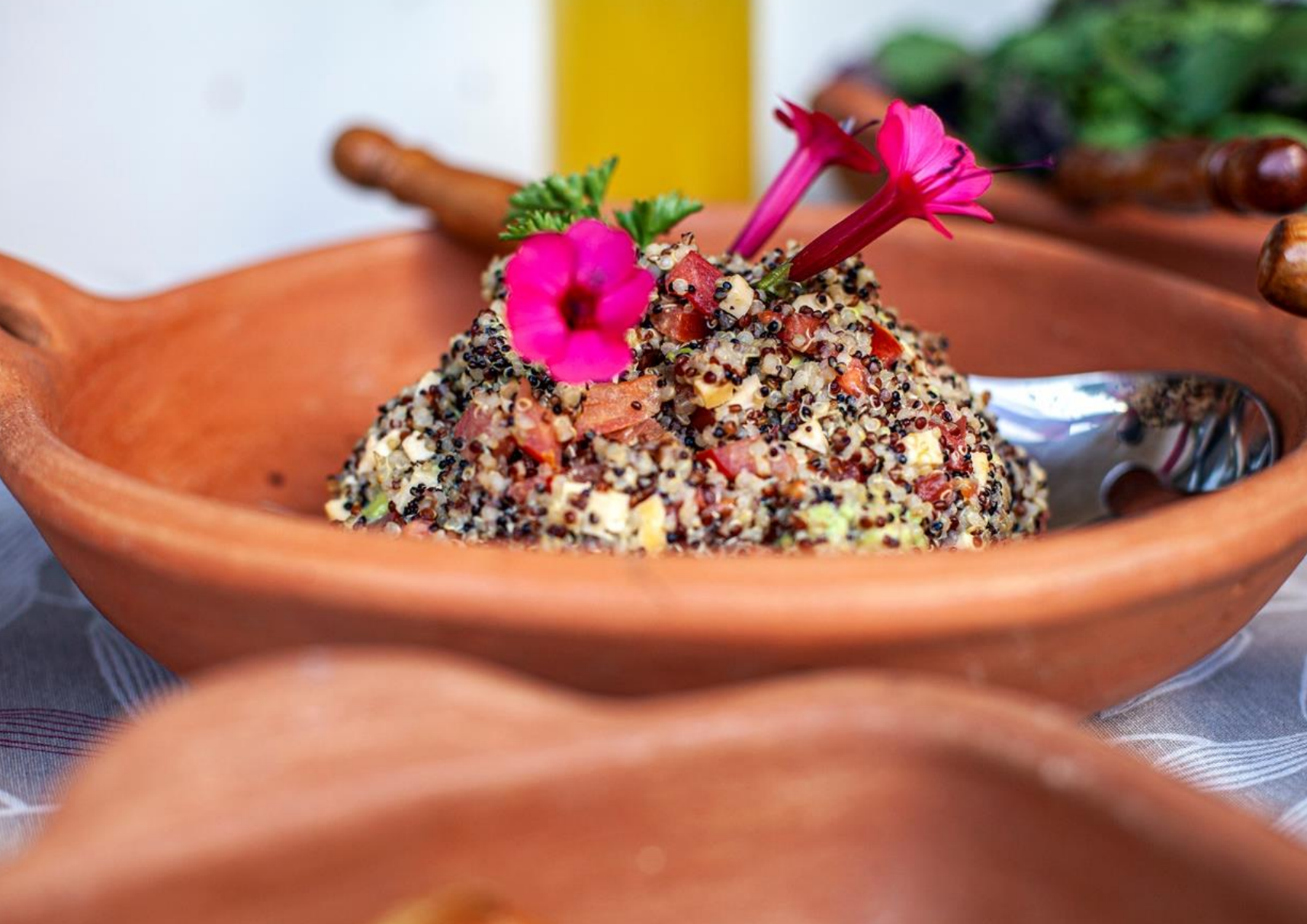
Typical Quinoa Preparation